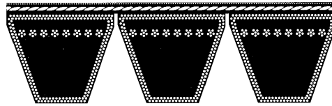
5VF & 8VF CROSS SECTION VIEW